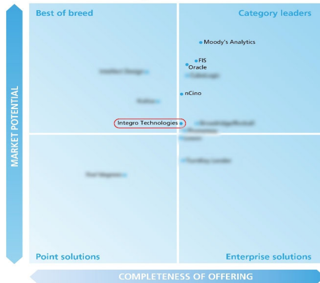
Chartis RiskTech Quadrant® for Limits Management Solutions, 2022

The RiskTech Quadrant® is a trademark of Infopro Digital Services Limited ("Infopro Digital") and is used herein with permission. All rights reserved. This graphic was published by Infopro Digital as part of a larger research document ("Credit Lending Operations, 2022: Market and Vendor Landscape," published in June 2022) and should be evaluated in the context of the entire document. Infopro Digital does not endorse any vendor, product or service depicted in its research publications, and does not advise technology users to select only those vendors with the highest ratings or other designation. Infopro Digital's publications consist of the opinions of its research analysts and should not be construed as statements of fact. Infopro Digital disclaims all warranties, expressed or implied, with respect to this research, including any warranties of suitability or fitness for a particular purpose.